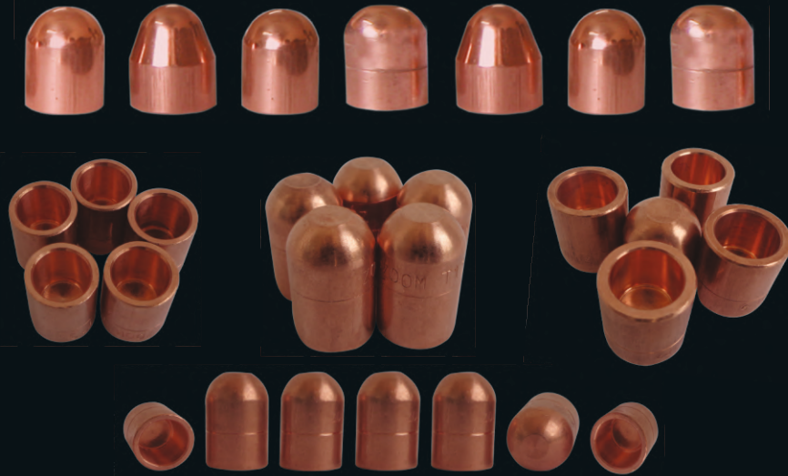
Chromium Zirconium Copper Cap Tips and Zirconium Copper Cap Tips